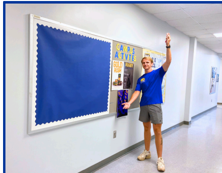
Board in the middle of the hallway