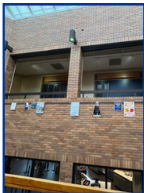
Cork strips over main staircase