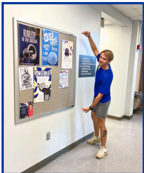
Board outside of the Aerobics Studio