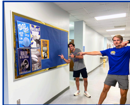
Board outside of locker rooms