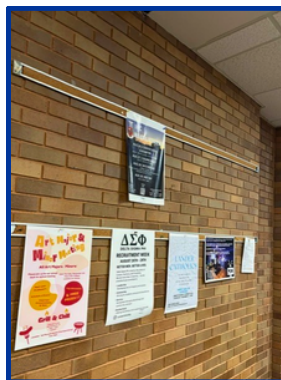
Cork strips inside the CC Commons