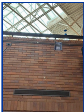
Cork strips over commons bridge