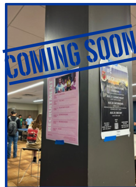
Cork shapes on the column in the Bearcat Lounge