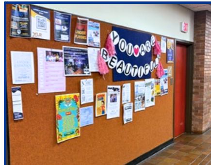
Board outside of the Business Office