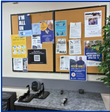
Bulletin board on main floor by restrooms