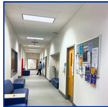
Next to vivarium on the 1 st floor