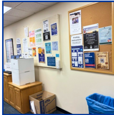
Bulletin board in the Computer Commons