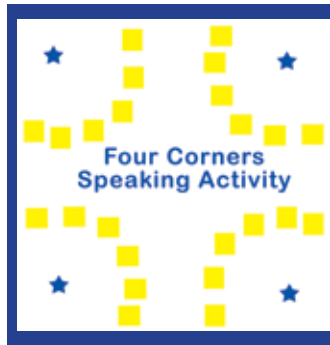
Four corners classroom set up

Activity: Next, divide the students into four groups (a group for each corner). I purposefully put students who may not know one another well, who can learn from one another, or who have similar issues, together in a group. The students will deliver their presentation to their mini-audience. Four