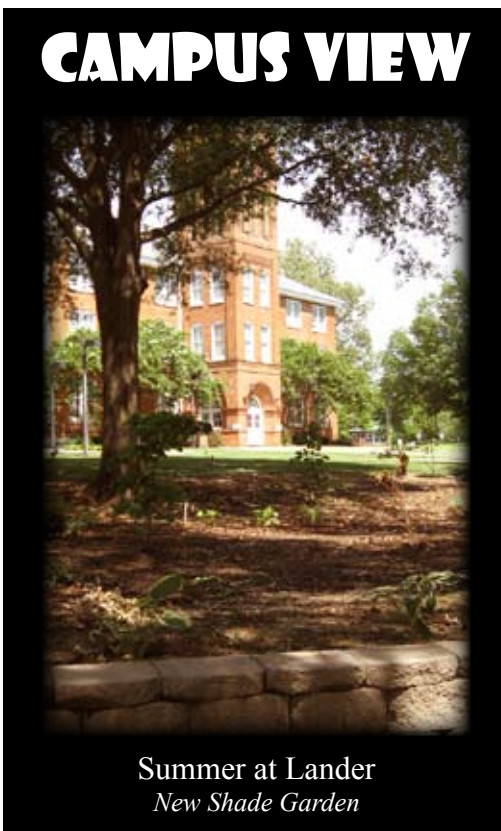
Summer at Lander New Shade Garden

[ http://www.facultyfocus.com/articles/trends-in-higher-education/web-2-0-tools-in-the-classroom-embracing-the-benefits-while-understanding-the-risks/ ]; June 22, 2011