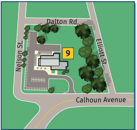
Lander University Legion Hall 806 Calhoun Ave.