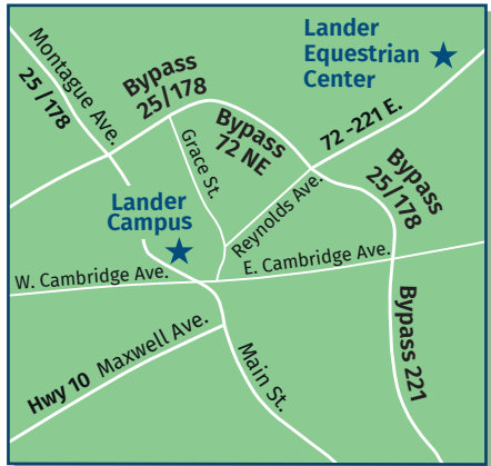
Lander Equestrian Center 2611 Hwy. 72-221 East