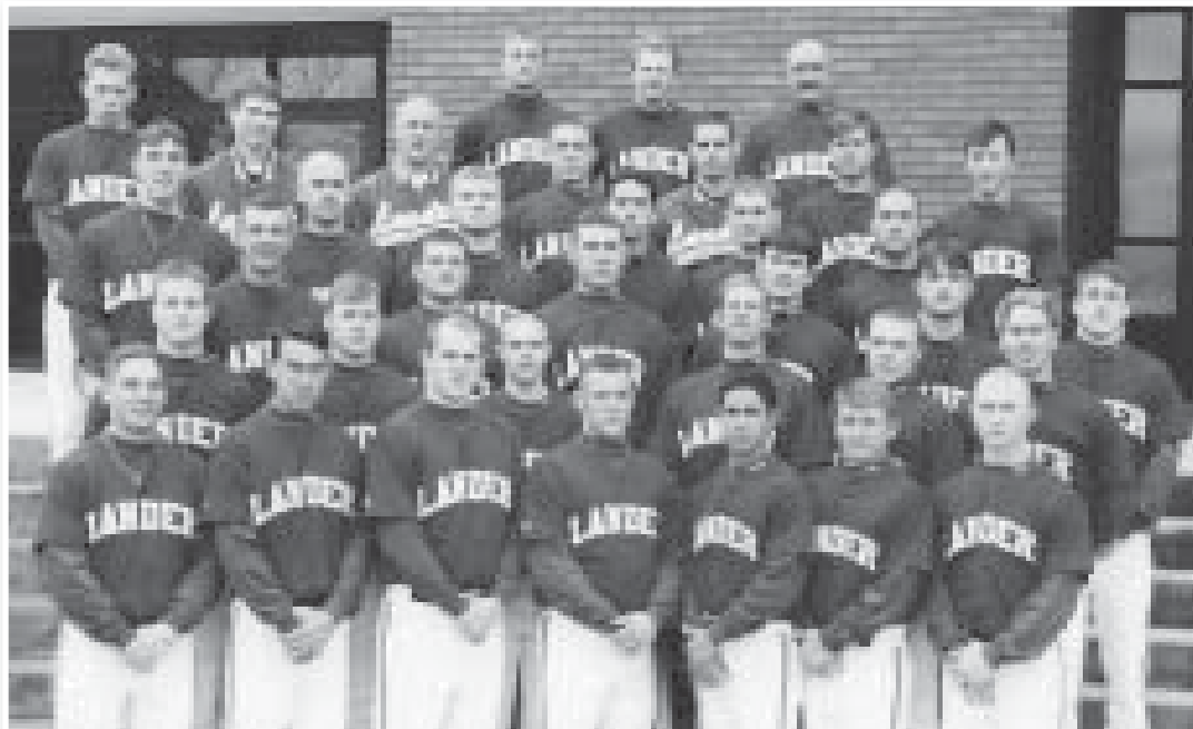
1998 - The Inaugural Baseball Team