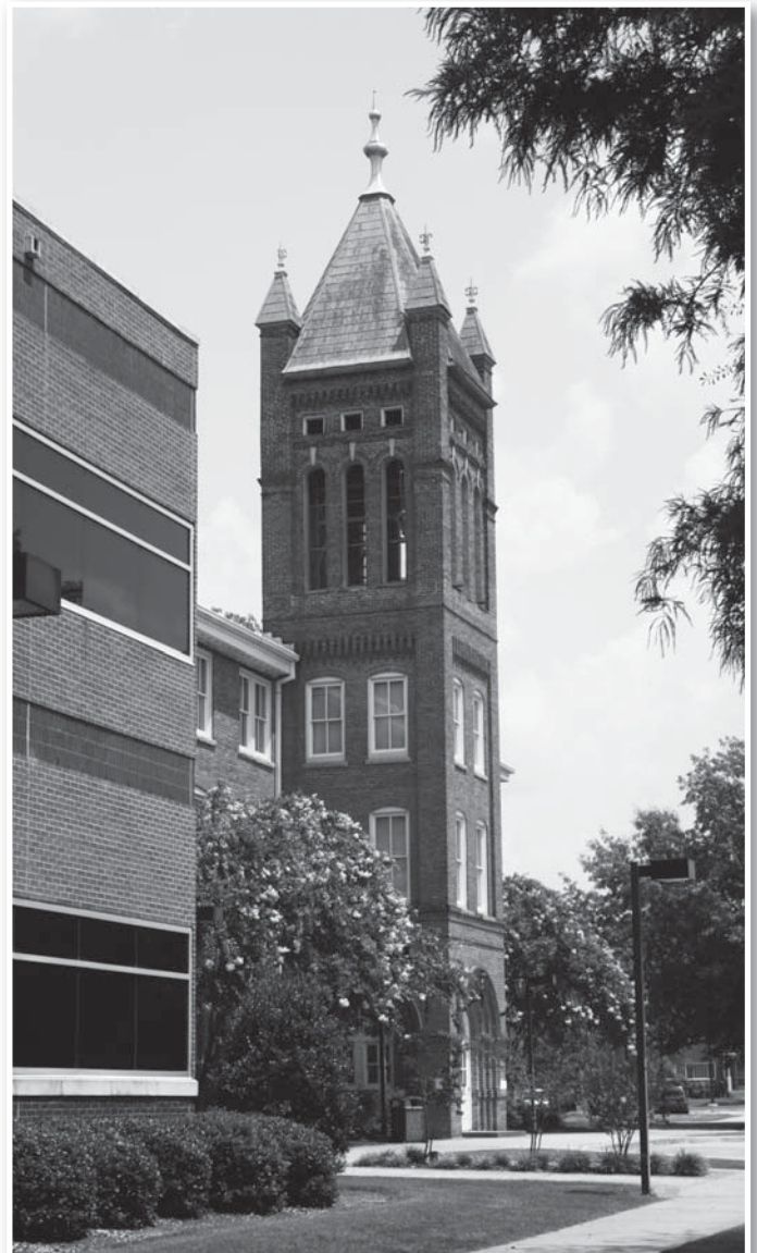
The Tower Building is a landmark on the Lander campus.