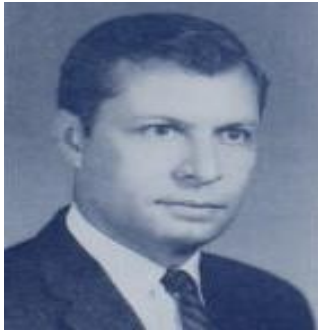
This photo comes from the 1963 edition of The Naiad, Lander's yearbook.