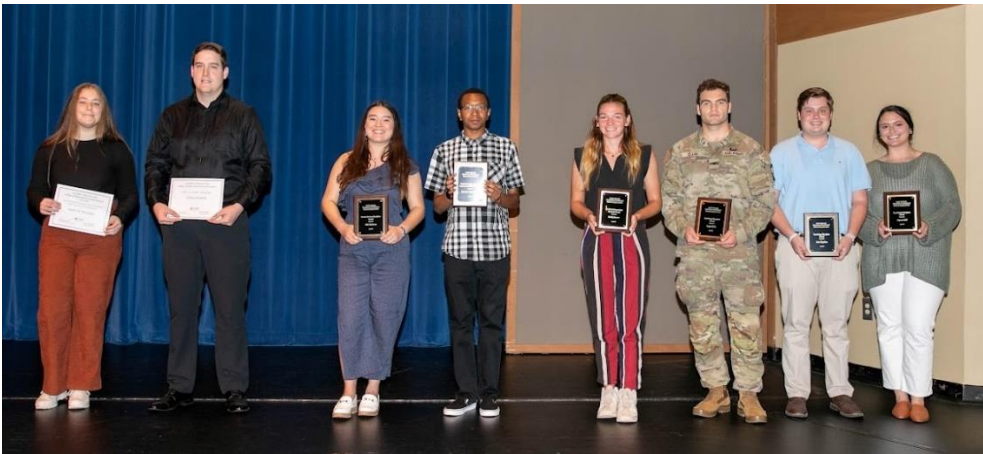
Dept. of Psychological Science and Human Services students who won academic awards and departmental scholarships.