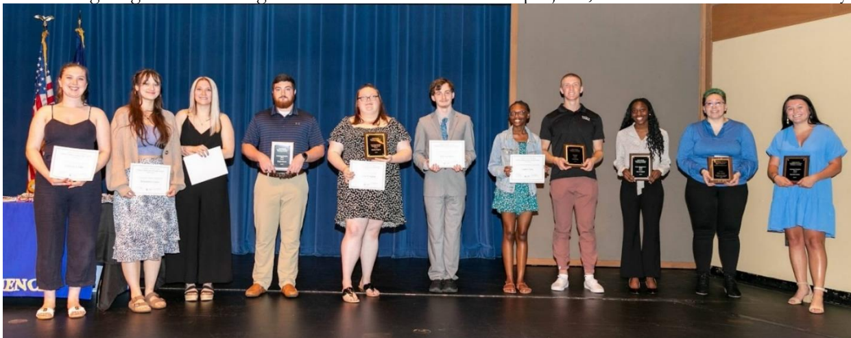
Dept. of Government, Criminology, and Sociology students who won academic awards and departmental scholarships