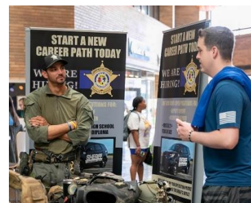
Students benefit from career fairs regularly on campus.