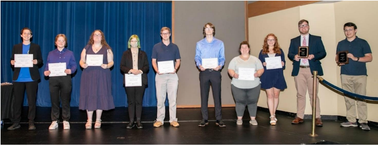
Dept. of History and Philosophy students who won academic awards and departmental scholarships