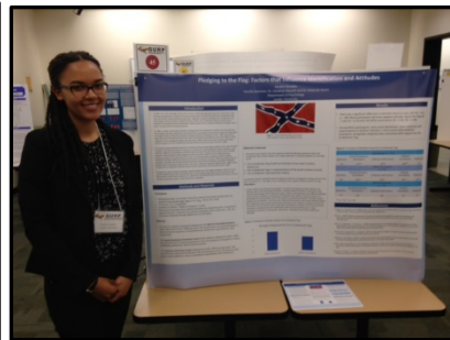
Students presenting their own research at capstone conference presentations