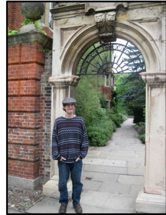
Honors students on Break Away in Washington DC, Italy, and England.