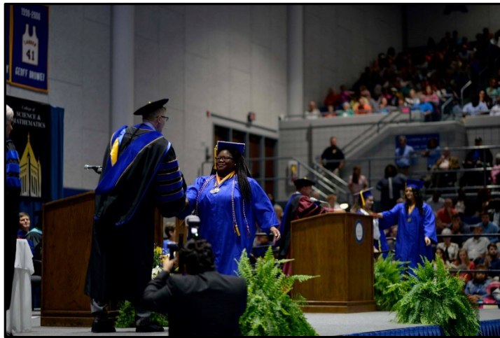
Recent Honors Medalists at graduation