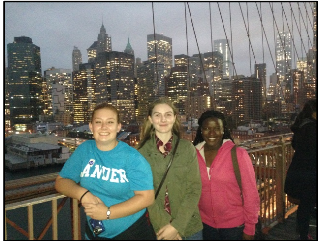
HONS 210 fieldtrip to New York City